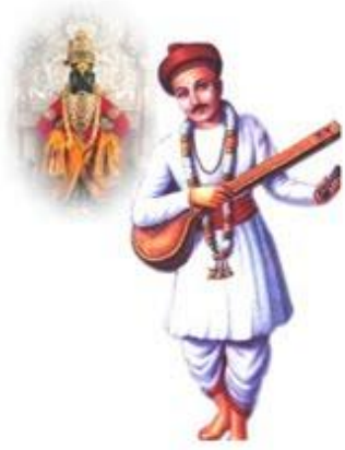
श्री. संत नामदेव महाराज